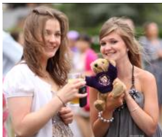
Leavers' Garden Party

An important element in building confidence is to celebrate success. We look for opportunities to highlight all achievements, whether they are academic or other. Our Day of Celebration is our annual opportunity for the whole school community - parents, pupils, staff and other stakeholders - to come together to celebrate all that has been achieved. Our very active Parents Association (FOS) holds an annual Leavers' Garden Party which is a special time when we are able to reflect on the past and wish you well for the future. Many girls make life-long friendships from the relationships they make here in the sixth form.