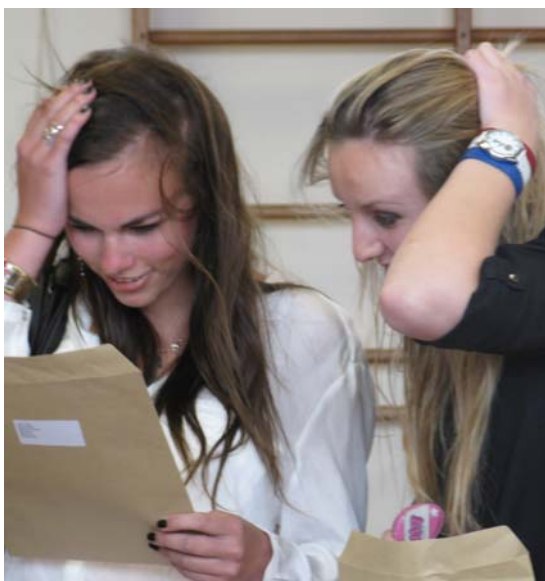
Girls receiving their results on results day in August 2011

Last year 94% of our leavers went on to university, seven girls gaining entry to Oxbridge colleges, and over 50% going to one of the Russell Group Universities. Our Careers Adviser, Post-18 Co-ordinator, and Director of Sixth Form Studies will, along with form tutors and subject staff, support you as you investigate your next steps and the best way forward post sixth form. In addition we work closely with you when it comes to writing personal statements, UCAS applications or applying for jobs.