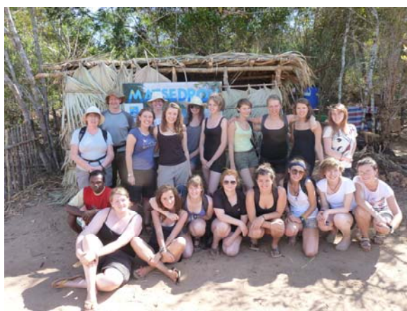
Students taking part in Operation Wallacea, Madagascar, July 2011

Towards the end of Year 12 and during the autumn term of Year 13 the Extended Project Qualification (EPQ) forms a part of our sixth form programme of study. Each girl is given the opportunity to undertake extensive research into a topic of her choice and then create a final 'product' which is presented to her peers. Whilst most girls choose to do this as a 5000 word essay, it is possible to present work in an alternative manner if it is more appropriate for the subject area under consideration. In previous years girls have conducted research into genetics, criminal behaviour, eating disorders, dark matter, the future of physics in medicine, legal meta-language, Uganda, Spanish politics, theology, and mathematics – amongst many other areas.